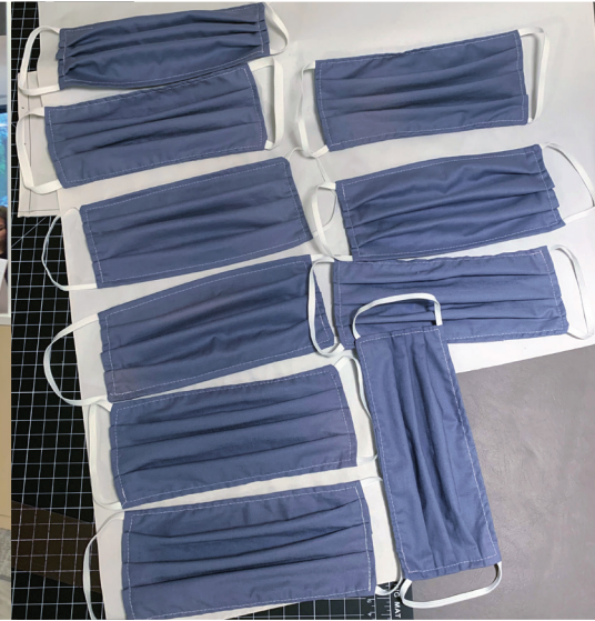
Handcrafted masks made by a staff's family member